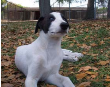
“I’m cute. I know it”