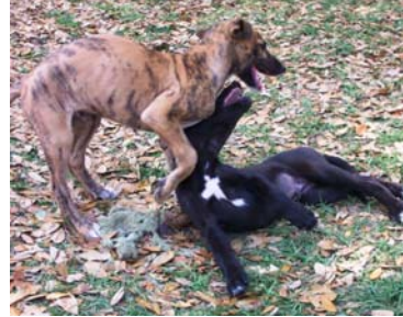
“Hey, what are friends for?”