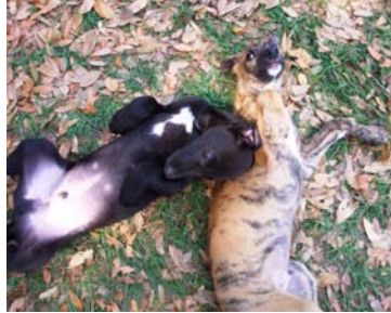
“We’re practicing the cockroach position.”